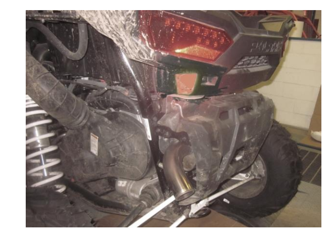
Congratulations! You are ready to begin experiencing the improved performance and driving excitement of your MBRP Ltd. ATV Exhaust upgrade. We know you will enjoy your purchase.

5. Install the stock spark arrestor into the Muffler Assembly outlet using the stock hardware.